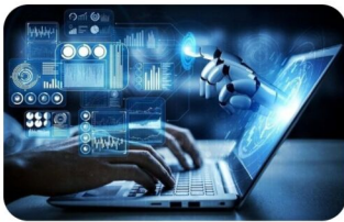
Computers Science & Engineering/DS/ Cyber Security/Cloud Computing