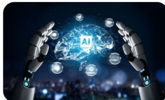
Artificial Intelligence & Machine Learning