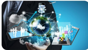
Information Science & Engineering